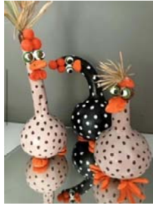
Harvest Creation by Irene Bausmith